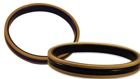
CTG can create T-seals to your exact specifications

CTG's experienced engineers will custom tailor T-seals to your exact requirements, and manufacture 1 or 1,000 seals to your specifications that same day.